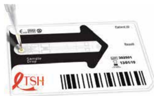
Step 1 Load sample