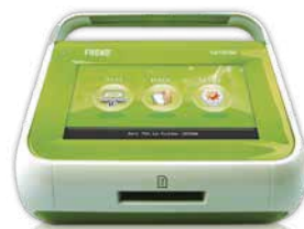
Step 2 Insert cartridge