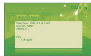
Step 3 Get results